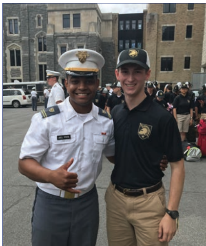
West Point Summer Leadership Institute

it only strengthened his resolve to pursue a position in the starting class of 2020. He particularly enjoyed the lectures on ethics and leadership. It is widely known that the "Academy is focused on inspiring and admitting diverse, high caliber young men and women ensuring that each graduate is a commissioned leader of character, committed to the values of Duty, Honor, Country