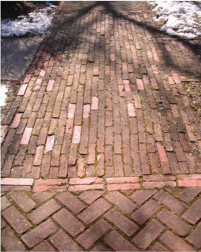
The City of Rockville preserved the original brick driveway apron at 103 North Adams when the property was redeveloped in the early 1980s