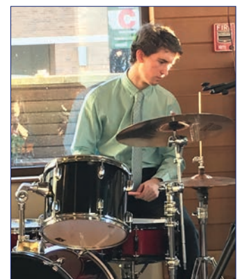
Playing with the faculty band at a charity performance