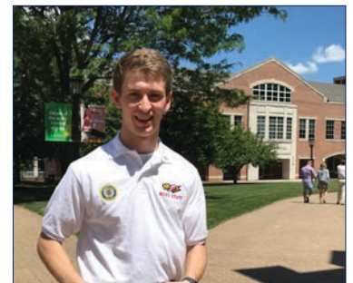
Boys State at Westminster College