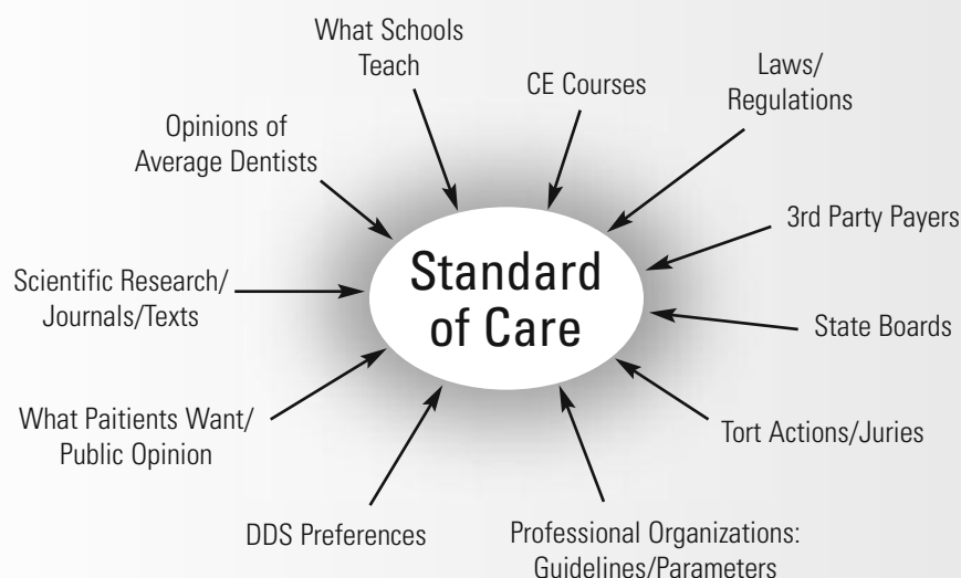
FIGURE 1. ELEMENTS of the DYNAMIC STANDARD of CARE

The standard of care turns out to be the result of competing experts, judged by a jury of lay citizens in specific cases.